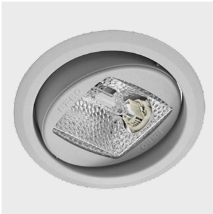
WideWing reflector (BBS 100 W)

The light cones of the WideWing reflector have a beam angle of 80° to the display width and 90° to the display length. This reflector is ideal in the pivoted position for illuminating sloping surfaces. Long, wide product displays illuminated from a low height. Tiered fruit and vegetable displays and product display tables are typical areas of application.