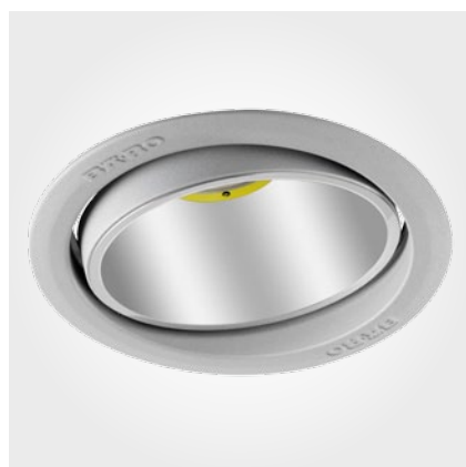
LED Basic reflector with a beam angle of 40° or 60°.