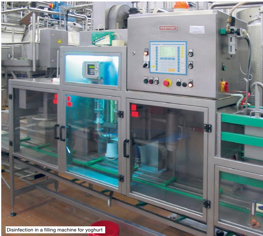
Disinfection in a filling machine for yoghurt

BÄRO's IP 65 UV-C compact lamp provides a particularly high degree of protection against dust and water. The use of UV-C compact emitters also allows excellent disinfection effects to be achieved, even within confined spaces. 253.7 nm UV-C radiation is used to reduce the number of germs. This wavelength has a lethal effect on microorganisms such as bacteria, moulds yeasts and viruses. Low-pressure UV-C emitters that produce no ozone serve to generate the short-wave UV-C radiation, which provides a high level of radiant efficiency. A special interior coating of the quartz glass ensures an exceptionally long service life with minimal decline in radiative power.